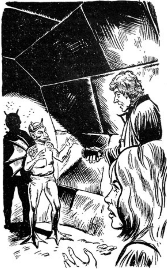
There stood the gargoyle from the Cavern