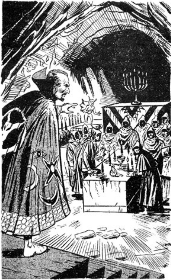
Grouped around the Stone of Sacrifice were twelve figures in hooded black gowns.

He swept down the stairs, his scarlet robe a-flying and approached the Stone of Sacrifice on which were now seven black candles, a chalice and a thurible covered with runic signs. Taking some incense from one of the hooded figures, the vicar threw it into the thurible. There was a flash, and a